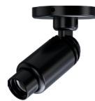
L-MSPS-10 1W Standalone Remote Dimmer

Please check product cut sheets for details - driver indications vary per product.