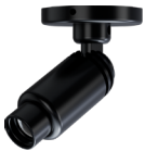
L-MSPS-10 1W Standalone Remote Dimmer