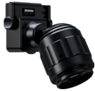
L-MTSP-02 L-MTSP-02 with onboard dimmer