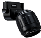
L-MTSP-01-ND 3W Spotlight No dimmer

Please check product cut sheets for details - driver indications vary per product.