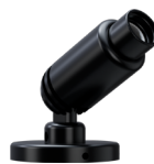
L-MSPS-10 1W Standalone Remote Dimmer

Please check product cut sheets for details - driver indications vary per product.