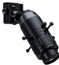
L-MTFS-02 3W Quadri - Framing Shutter Spotlight