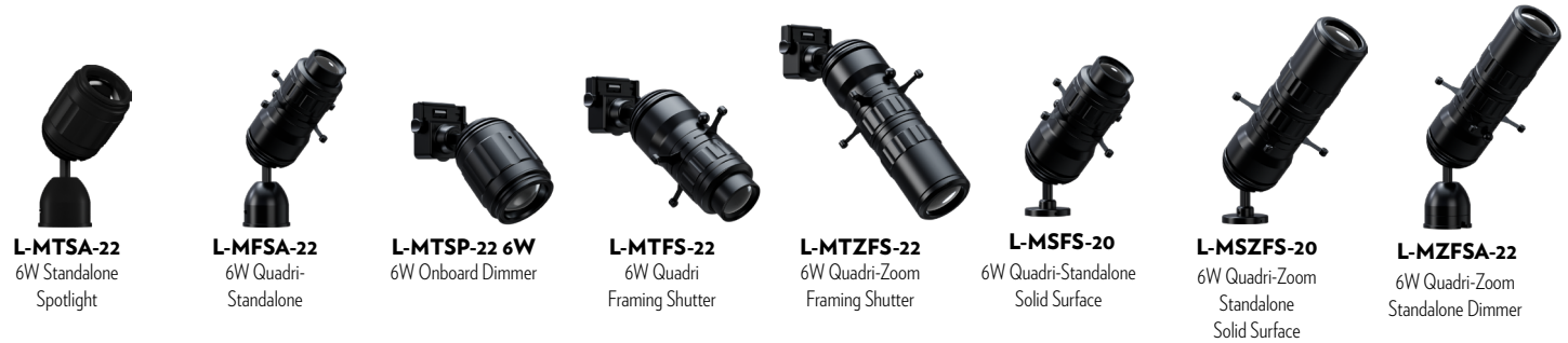
L-MTSA-22 6W Standalone Spotlight