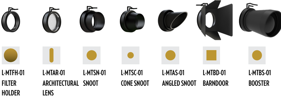
L-MTFH-01 FILTER HOLDER