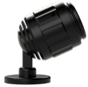
L-MSPS-00 3W Standalone Remote Dimmer