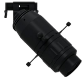
L-MTFS-02 3W Quadri - Framing Shutter Spotlight