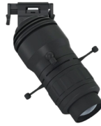
L-MTFS-22 6W Quadri Framing Shutter

Please check product cut sheets for details - driver indications vary per product.