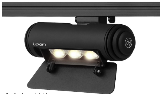
Barn Door Accessory included