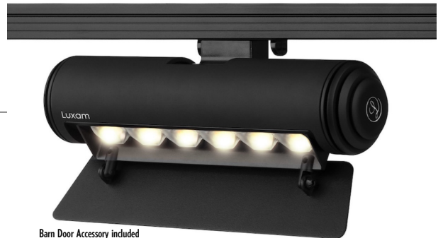
Barn Door Accessory included